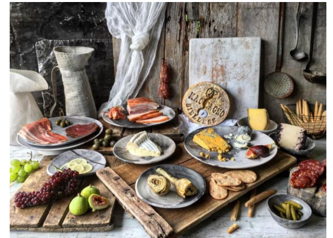
Saggars Fired Tableware