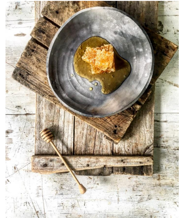
Raw Earth Plate with Honey | Saggars Fired

The first of its kind, Liquid Quartz™ is a non-toxic, food-safe, water based sealer that allows you to turn your unglazed decorative ware into waterproof, highly stain resistant functional ware. It can be applied to any unglazed, fired clay body; bisque ware, vitrified ceramics, or alternatively fired work (pit, smoke, saggars, barrel, naked raku etc.) to create a completely invisible yet highly effective protective barrier.