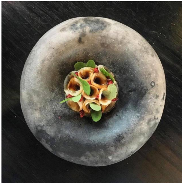
Ovoid Vessel | Food by Jock Zonfrillo Restaurant Orana

The first of its kind, Liquid Quartz™ is a non-toxic, food-safe, water based sealer that allows you to turn your unglazed decorative ware into waterproof, highly stain resistant functional ware. It can be applied to any unglazed, fired clay body; bisque ware, vitrified ceramics, or alternatively fired work (pit, smoke, saggars, barrel, naked raku etc.) to create a completely invisible yet highly effective protective barrier.