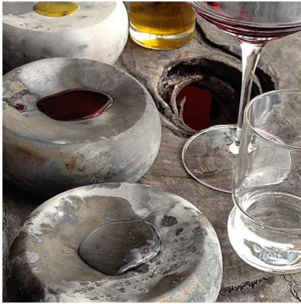
Ovoid Vessels with Olive Oil | Red Wine | Water