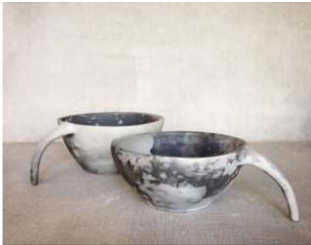
Detached Teacups | by Anna-Marie Wallace

The first of its kind, Liquid Quartz™ is a non-toxic, food-safe, water based sealer that allows you to turn your unglazed decorative ware into waterproof, highly stain resistant functional ware. It can be applied to any unglazed, fired clay body; bisque ware, vitrified ceramics, alternatively fired work (pit, smoke, saggur, barrel, naked raku etc.) & will create a completely invisible, breathable, protective barrier.