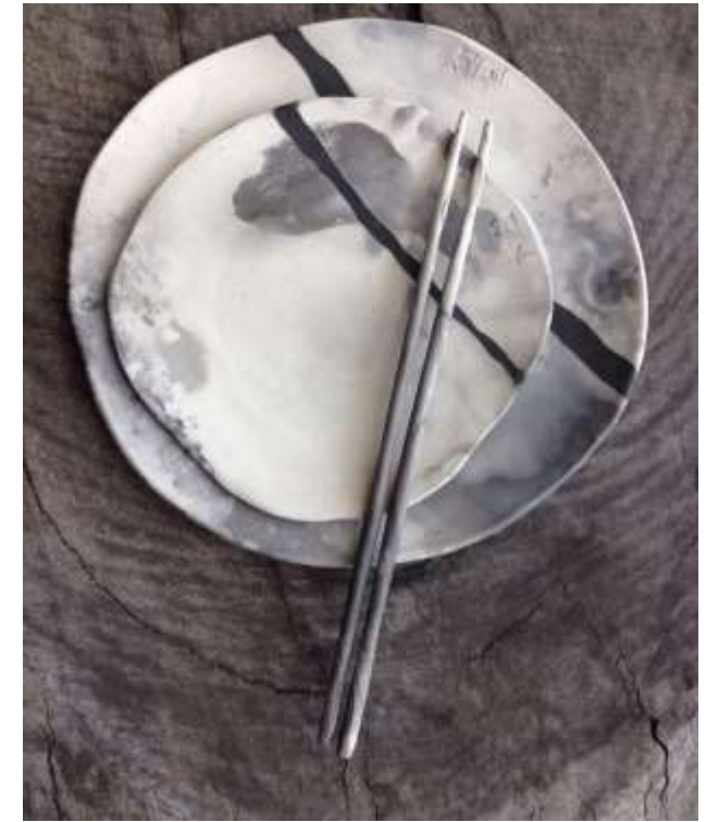
Wabi Sabi Plates & Chopsticks | by Anna-Marie Wallace